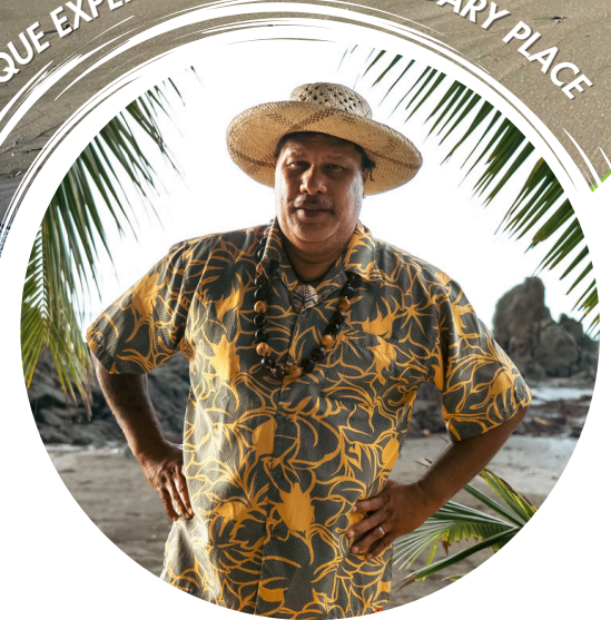
MATARI'I Polynesian Cultural Guide

A UNIQUE EXPERIENCE IN A LEGENDARY PLACE